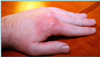
Figure 1: Acute gout episode with a swollen, red and painful finger

Gout is a type of arthritis that results in sore joints. With this type of arthritis, crystals form in the joint. This causes irritation that is sometimes also present in the tendons near the joint. Joints can become swollen, painful, and red (Figure 1). This condition can affect any joint in the body. The first gout attack often occurs in the big toe. The elbow, wrist, and finger joints are also common sites. Painful swelling can come and go in the same joint or in different joints.